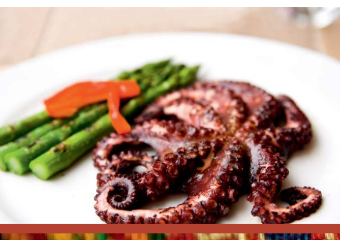
This page and opposite: getting stuck on Peruvian cooking. Opposite: taking in the sights and smells of Lima, Peru, and Valparaíso, Chile